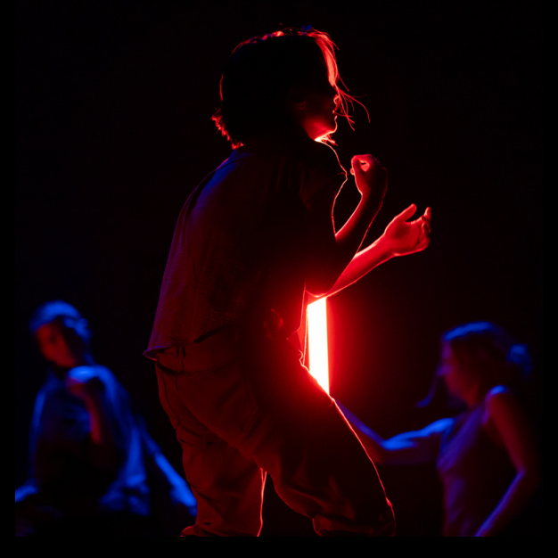
**A&I is a first of its kind performance that uses AI Technologies to listen to the performers and run the technical elements of the show.